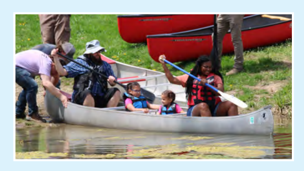
FESTIVAL OF SPRING Saturday, April 27, 12-4pm

Help clear trash from the banks of the Sangamon River to make it a safer and more beautiful place for wildlife and people. Dress to get dirty and bring your own gloves. Bags will be provided. Come by yourself or bring the whole family. Organized groups should call 217-423-7708 in advance. Co-sponsored by the Community Environmental Council. Register and meet at the Rock Springs Information Shelter.