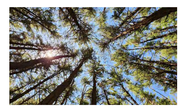
TALL TREES Wednesday, March 13, 10am-12pm

Homeschool children ages 5-15 can join a naturalist and explore nature and history topics through discussion, hands-on activities, crafts, and games. Homeschool students will spend time indoors and outdoors, investigating concepts and engaging with nature. $15/child. Register online by date specified.