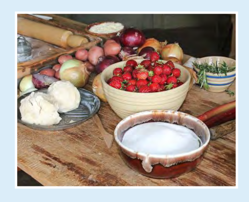
FOOD: NOW AND THEN Wednesday, May 8, 10am-12pm

Discover what all the fuss is about the recent solar eclipse! View the sun through our telescope, learn about the moon, sun, and stars, and learn about orienteering. Register online by April 8.