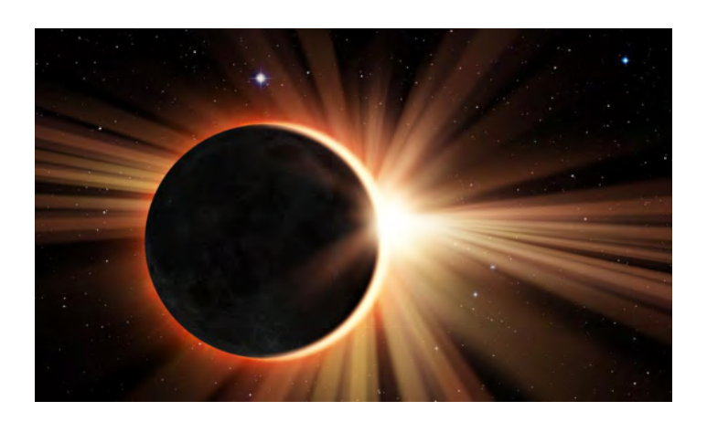
SUN AND STARS Wednesday, April 10, 10am-12pm

Learn the importance of trees in the ecosystem, discover some tree identification tips, and venture outside to see what you can find. Register online by March 11.