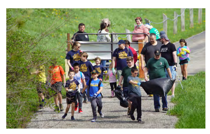
SANGAMON RIVER CLEANUP Saturday, April 27, 10am-12pm Rock Springs Conservation Area

Help clear trash from the banks of the Sangamon River to make it a safer and more beautiful place for wildlife and people. Dress to get dirty and bring your own gloves. Bags will be provided. Come by yourself or bring the whole family. Organized groups should call 217-423-7708 in advance. Co-sponsored by the Community Environmental Council. Register and meet at the Rock Springs Information Shelter.